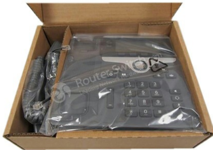
Figure 4 shows the unboxing view of CP-7821-K9.