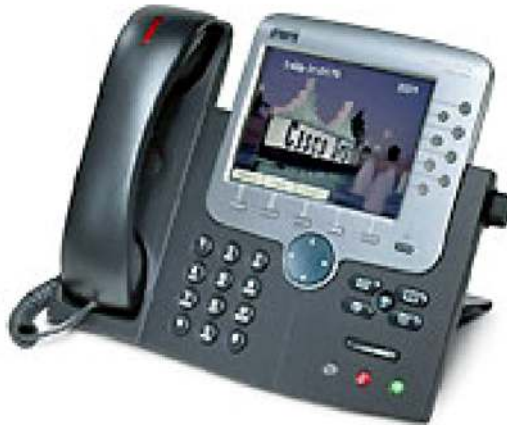
Figure 1. Cisco Unified IP Phone 7971G-GE

The Cisco Unified Communications system of voice and IP Communications products and applications helps organizations communicate more effectively—by helping them streamline business processes, reach the right resource the first time, and enhance productivity. The Cisco Unified Communications portfolio is an integral part of the Cisco Business Communications Solution—an integrated solution for organizations of all sizes that also includes network infrastructure, security, and network management products; wireless connectivity; and a lifecycle services approach, along with flexible deployment and outsourced management options, end-user and partner financing packages, and third-party communications applications.