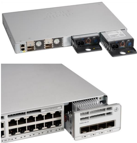
Figure 3. Cisco Catalyst 9200 Series Switch dual redundant power supplies

Table 4 lists the PoE power availability for each model.