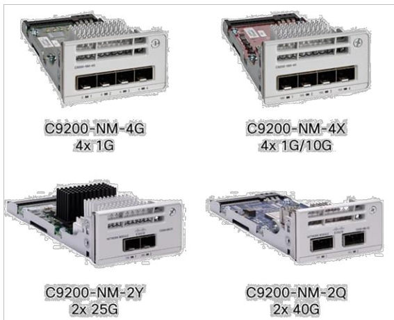
Figure 2. Cisco Catalyst 9200 Series Switch network modules

Cisco Catalyst 9200 Series switches come with modular or fixed uplinks as indicated in Table 1. With modular SKUs, the field-replaceable network modules provide infrastructure investment protection by allowing a nondisruptive migration from 1G to 10G and beyond. When you purchase the switch, you can choose from the network modules described in Table 3.