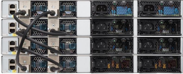
Figure 4. Cisco Catalyst 9200 Series Switch stacked units